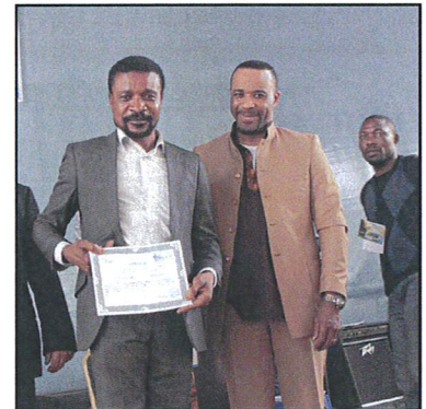
Every Pastor who attends will receive a certificate.