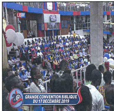
Church where conference will be held