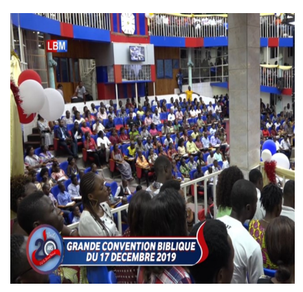
The pastors appreciate the opportunity to learn.